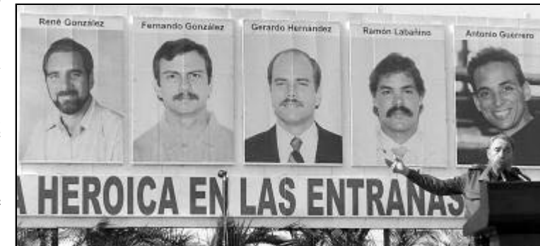
A bulletin board of the five Cubans in Havana, during a mass rally demanding their freedom.

The International Action Center is initiating the "Free the Five! National Committee to Free the U.S.-Held Cuban Political Prisoners, to demand their freedom.